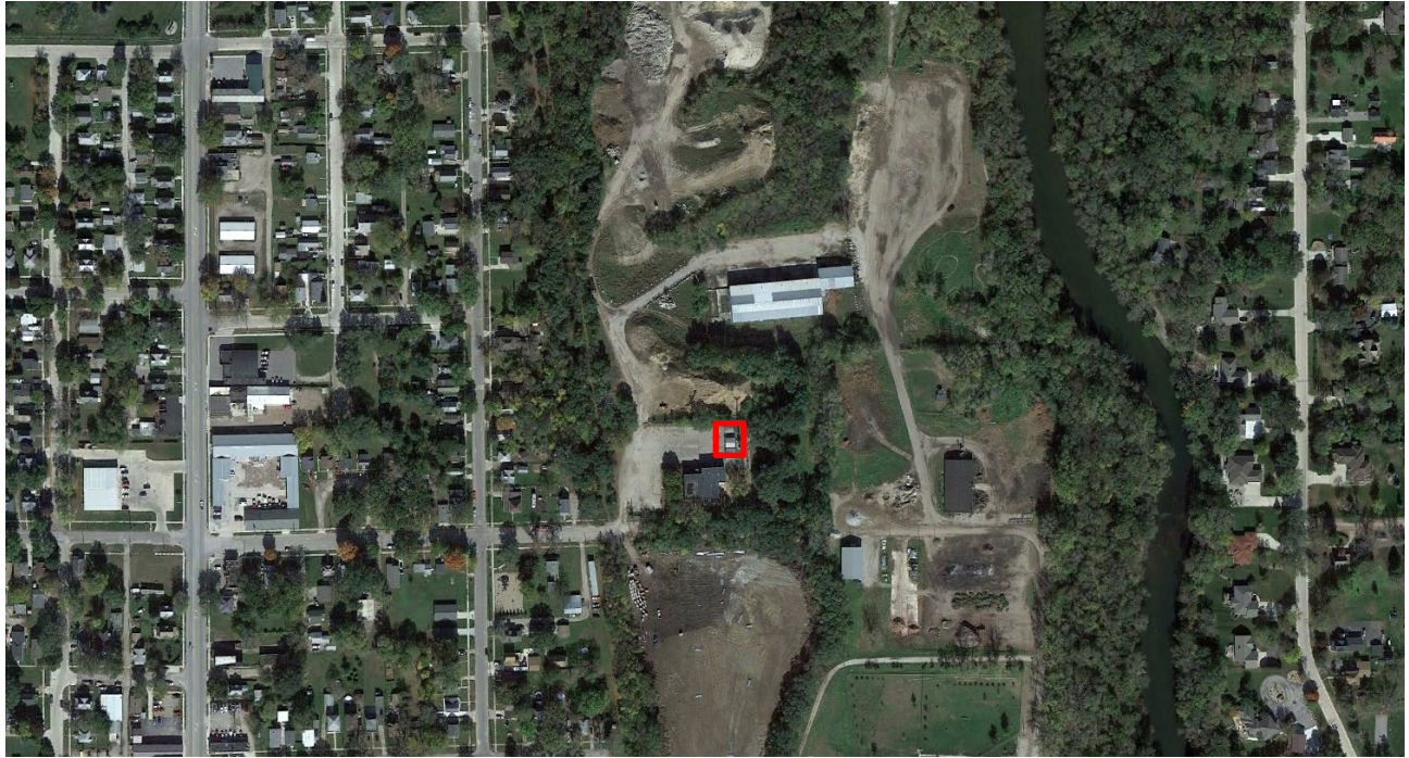
Site Location & Surrounding Properties